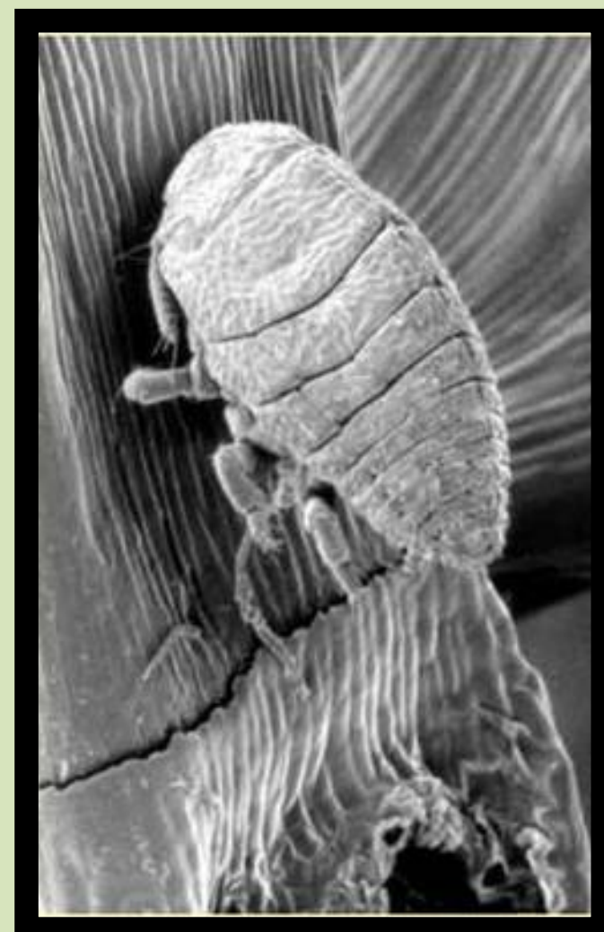
< 1.5 mm long